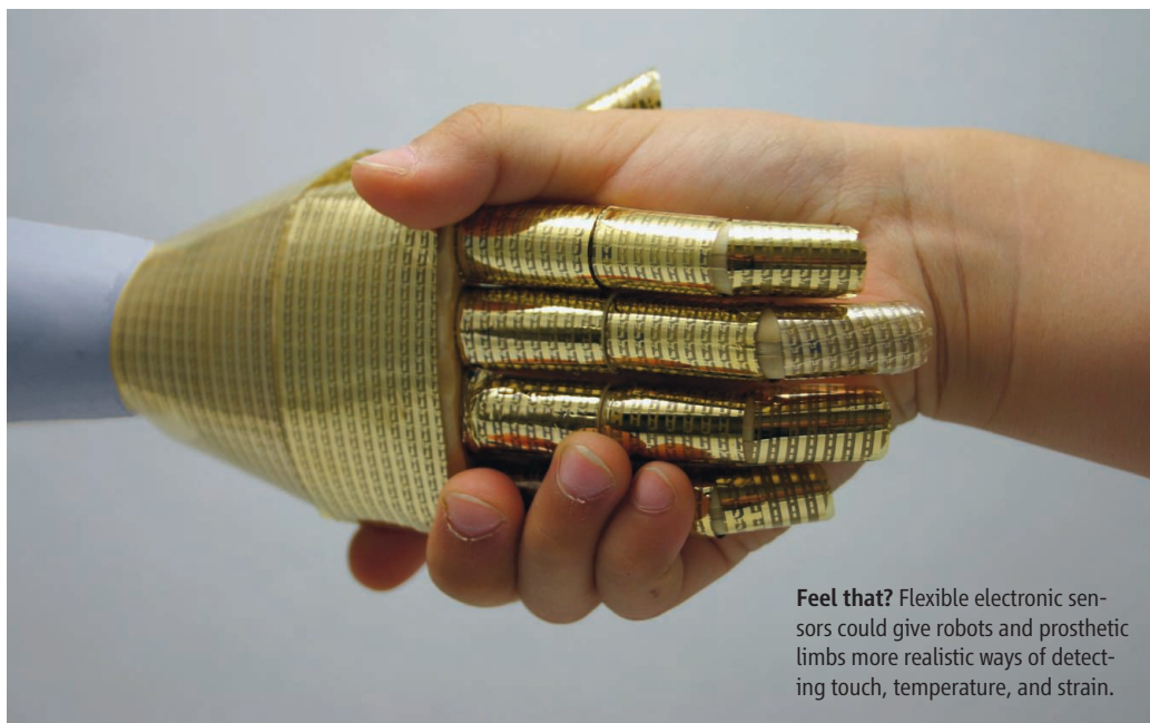
Feel that? Flexible electronic sensors could give robots and prosthetic limbs more realistic ways of detecting touch, temperature, and strain.

Other researchers are shrinking devices to pack more into a patch. One technology at this frontier is touch sensors. Most touch sensors work by spotting how pres-