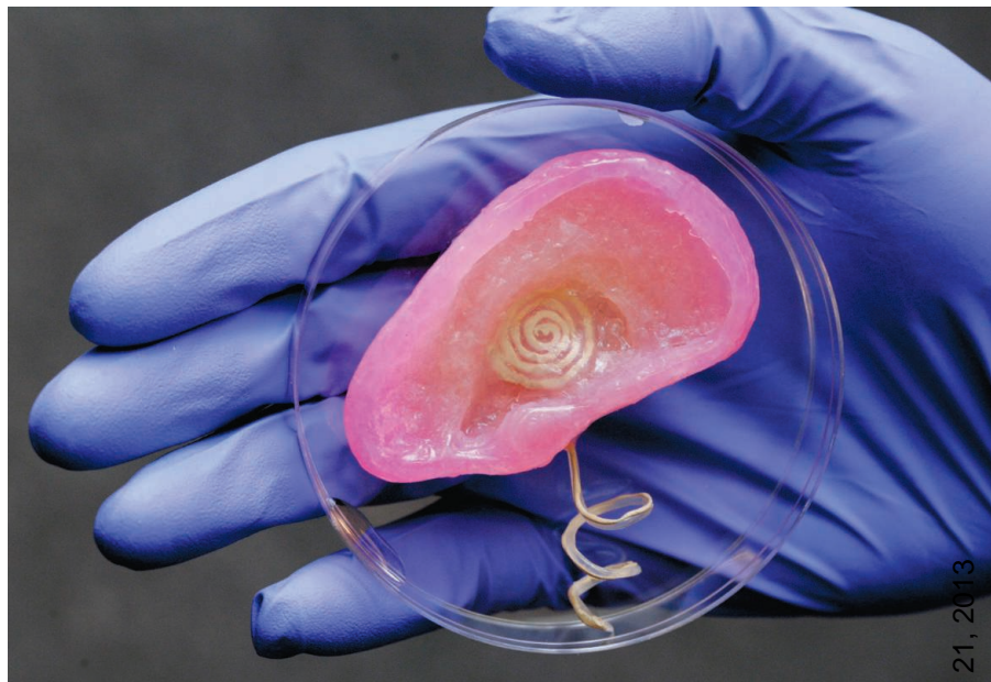
Big and small. Bioelectronic advances include using tiny light emitters to study brain development ( left ) and engineering a functional ear ( above ).

ally be useful in providing high-resolution touch sensing to prosthetic limbs, or giving robots a tactile sense sharp enough to identify what they're touching, or making signature readers capable of sensing not only the swoops of a handwritten signature but characteristic changes in pressure as well.